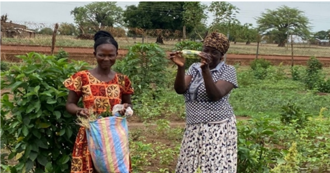
Sale of vegetables on farm