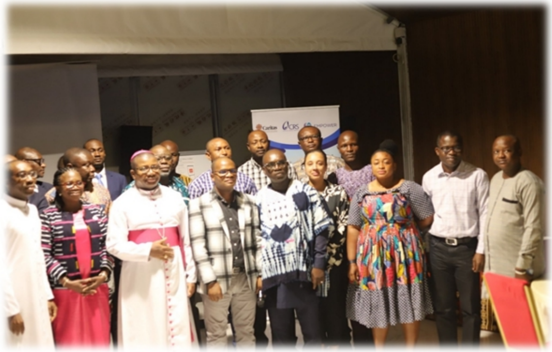
Group Photograph of Participants with the Archbishop of Abidjan