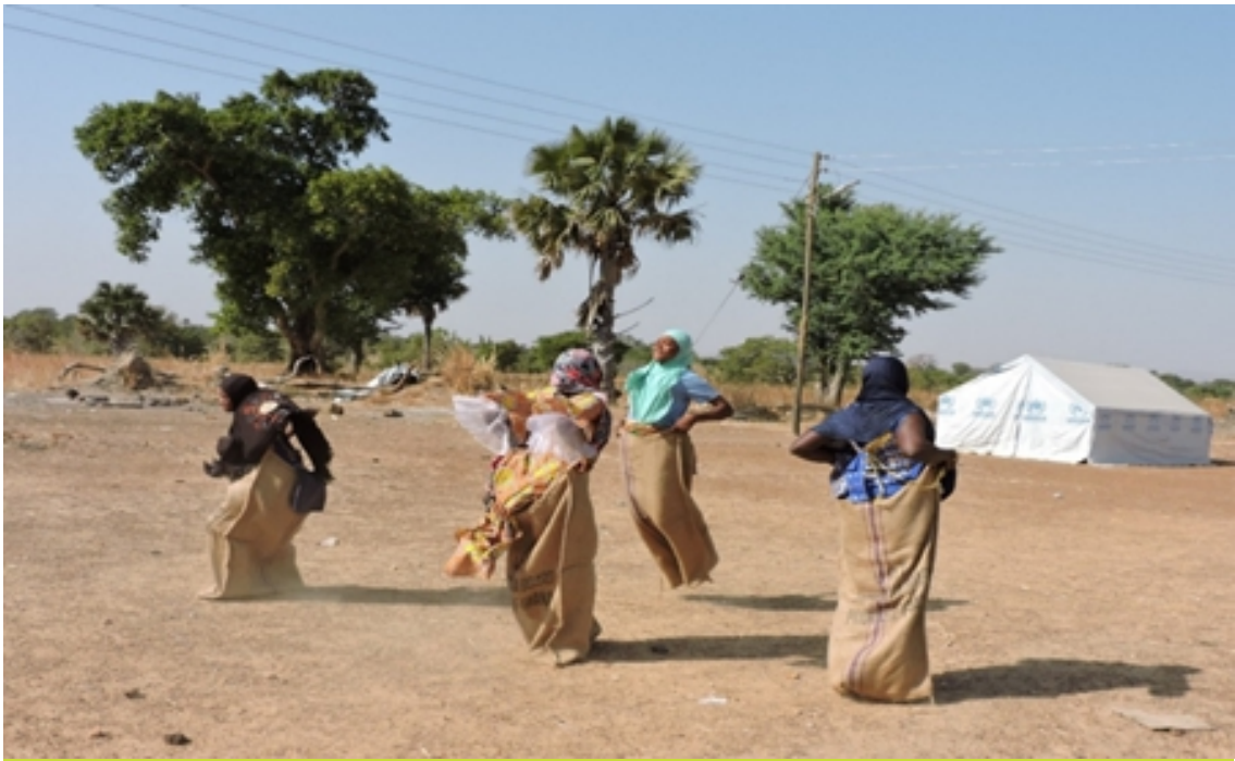
Sack Race by Female asylum Seekers during Christmas Party, Reception Centre, Tarikom

As part of partner complementarity, NABOCADO organized Christmas party and fun games for asylum seekers at the reception centre on the 22nd December 2023. Asylum seekers, staff of NABOCADO and other implementing partners participated in fun games (oware, ludo, dancing competition, sack and egg race. Asylum seekers were served with food and drinks of their choice. This celebration brought all the ethnic groups together and improved social cohesion.