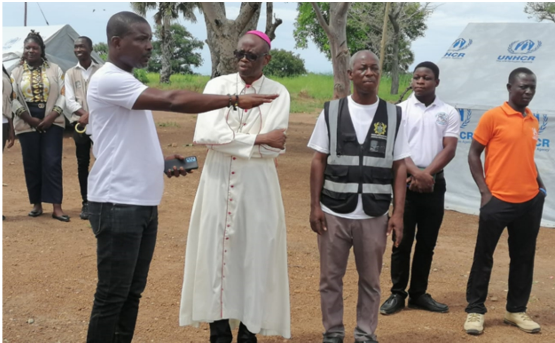
Visit of the Bishop of Navrongo-Bolgatanga Diocese, Bishop Alfred Agyenta to the Reception Centre at Tarikom, Ghana

There are 7000 asylum seekers in the Upper East Region of Ghana, 3,218 were targeted by GRB for the relocation to the Reception/Settlement Centre. As at 5th February, 1051 were relocated to the Settlement Centre. Asylum seekers were provided with key services by different partners. In response to the needs of the asylum seekers in Ghana, the United Nations High Commission for Refugees set-up a Field Office in the Upper East region which also has oversight responsibility for those the Upper West Region. In June 2023 the Ghana Refugee Board (GRB) established a reception Centre at Tarikom to receive Burkinabe Asylum Seekers living in border communities in the Upper East Region. The Asylum Seekers lived at the Reception Centre (centre had a holding capacity of 2,500 people at any given time). Lands were released for these centres by the traditional authority of the area in consultation with land owners. A total of over 50 acres of land released by the Divisional Chief of Tilli for hosting the asylum seekers