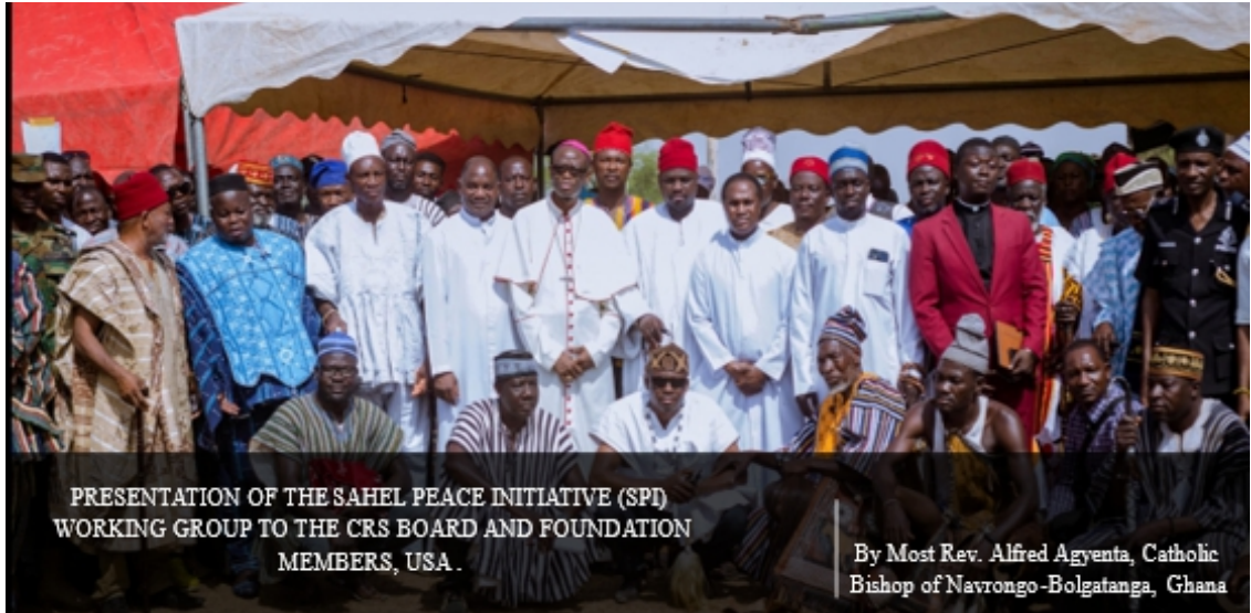
Landmark photo of Reconciliation and adoption of non-violent approaches by Doba-Kandiga citizens.