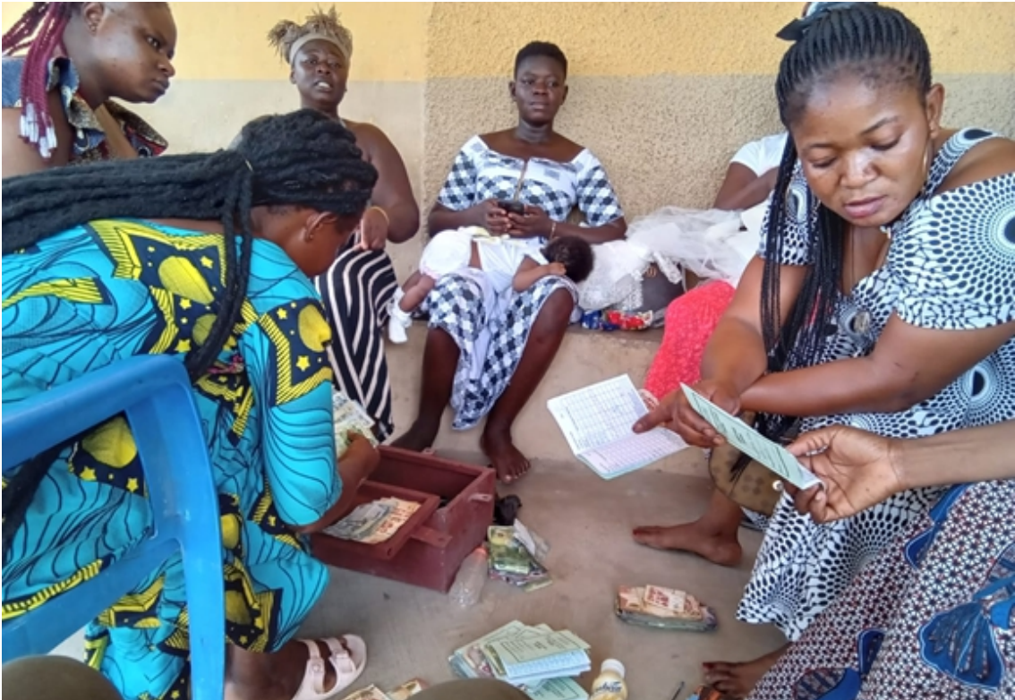
Sharing of solidarity fund

With Support of MISEREOR, Germany, a total of 309 women groups were organised with a membership of 9,767 who mobilised GHS 180,625.70 for solidarity activities and GHS 2,516,556.00 for self-loaning for businesses.