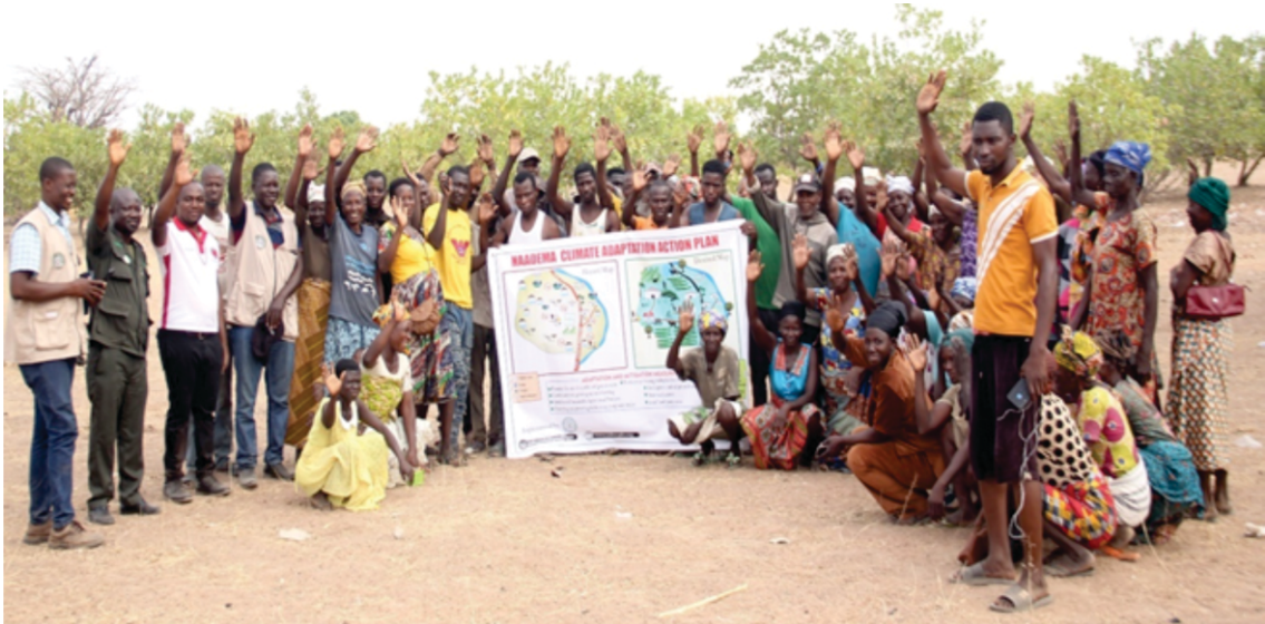
Display of climate change adaptation and mitigation plan

Farmers in 26 targeted communities were supported to consciously develop climate change adaptation and mitigation plans. They have been implementing these plans aimed at reducing the effects of climate hazards on their livelihood activities. They were further supported with joint visits by key stakeholders such as forestry commission, department of food and agriculture and the various district Assembles in the implementation of their climate change action plans.