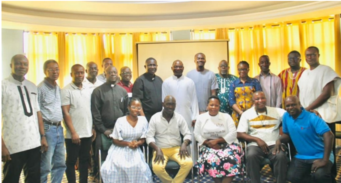
Members of Arc/DDOs, CRS Ghana Country Representative and Staff and NABOCADO team

All Arc/Diocesan Development Officers in Ghana met in Bolgatanga for a learning exchange hosted Navrongo-Bolgatanga Catholic Development Organisation (NABOCADO). Catholic Relief Service, Ghana underscored the importance of institutional strengthening and capacity development of Arc/Diocesan Development Offices for efficiency, effectiveness and professional governance and management in the changing donor focus on localisation.