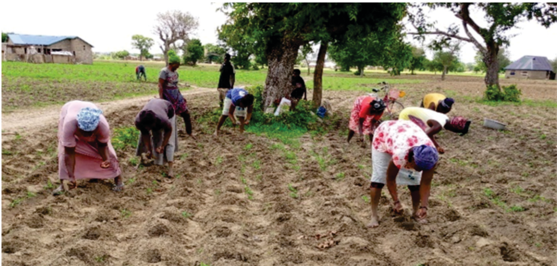
Compost application (Zai method) at Nyangoligo community