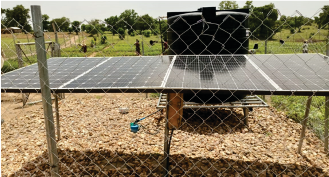
Solar mechanized borehole garden in Lore Yakin community

NABOCADO worked with 15 communities to introduce solar mechanized boreholes for dry season farming. Boreholes are drilled and mechanized with solar for farmers mostly women to use for vegetables production. Currently, 2170 women farmers in the 15 communities have solar mechanized boreholes and are producing all year round.